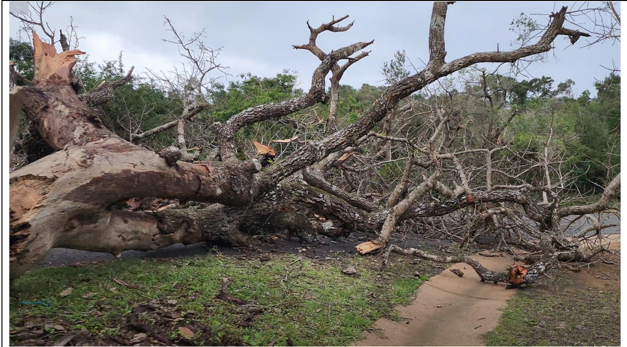
Some of the damages on the road to Mission Rock