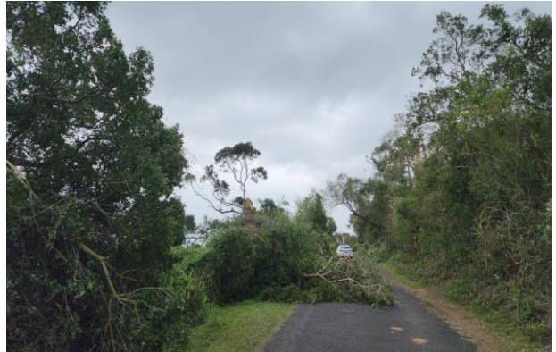
The damages to infrastructure in Cape Vidal

iSimangaliso would like to assure the public and visitors that it will work tirelessly to ensure that the Park is fully ready to welcome visitors before the festive season. Majority of the infrastructural repair work has been completed already.